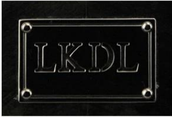
Metal plate logo