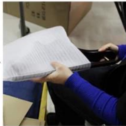
1pc Hanger with 1pc Bag