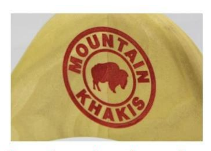
Laser logo in other color