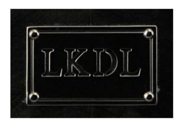
Metal plate logo