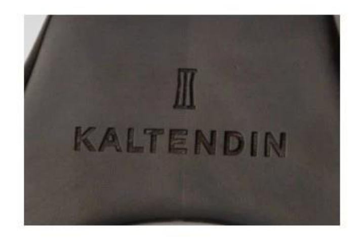
Laser logo before paint