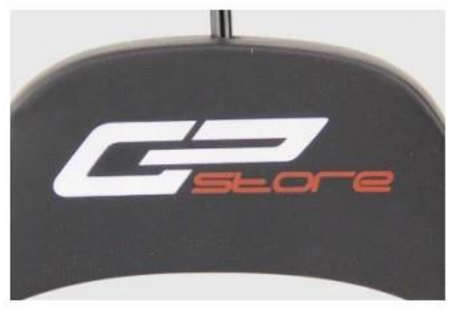
Silk-screen print logo

Silk-screen print logo : the most regular and cheapest logo effect for wood hanger, you can offer us the Pantone CU Color Card Number, we adjust ink color according it. And even can do two colors and three colors print logo. Laser logo before paint : the regular logo effect for wood hanger, laser engraved logo before paint hanger, the logo color will be same to the hanger paint color.