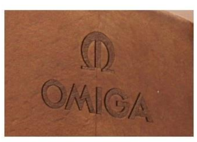
Laser logo before paint