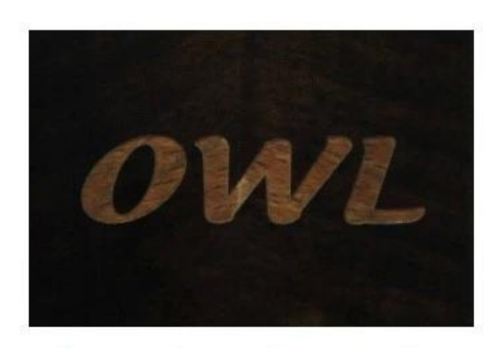
Laser logo after paint