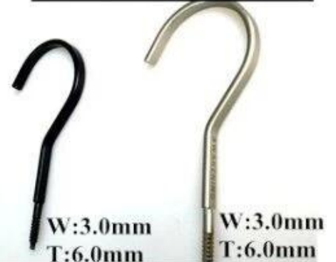
W:3.0mm T:6.0mm black