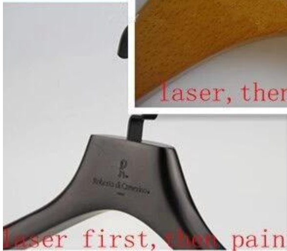
laser first, then paint