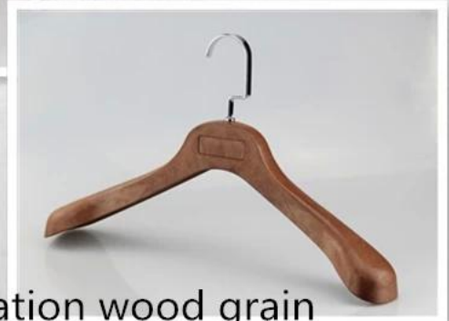
Limitation wood grain

electroplated: Electroplating is a process of coating a metal surface with a thin layer of another metal. This is done by immersing the object in a solution containing ions of the metal to be deposited. An electric current is then passed through the solution, causing the metal ions to be reduced and deposited onto the object's surface. Electroplating is used for various purposes, including corrosion protection, decorative finishes, and improving electrical conductivity.