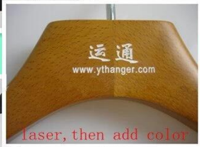
laser, then add color