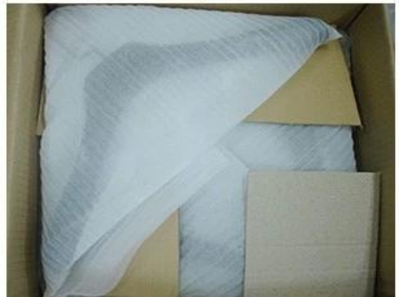
Place Layer by Layer