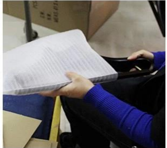
1pc Hanger with 1pc Bag