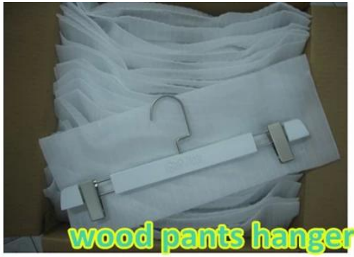
wood pants hanger