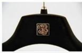
metal plate logo