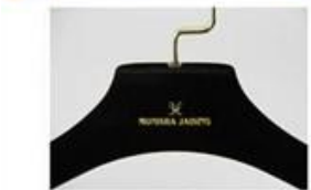
hot stamping logo