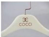
laser logo after painting