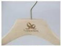
laser logo natural wood color