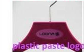
plastic paste logo