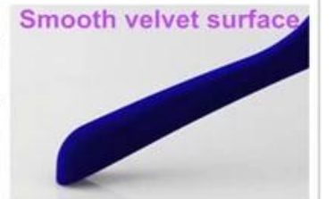
Smooth velvet surface