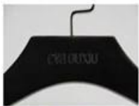
laser logo before painting