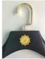
metal paste logo