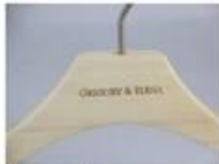
laser logo burn effect