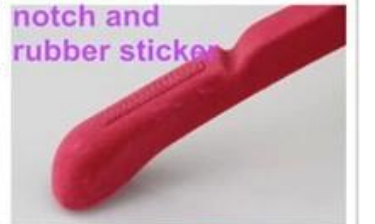
notch and rubber sticker