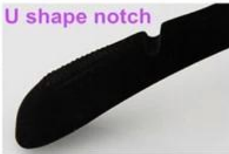
U shape notch