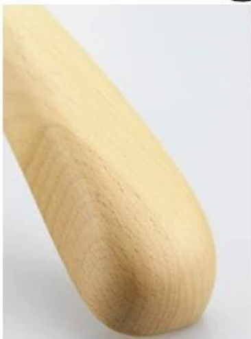
matte natural wood color