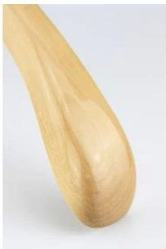
gloss natural wood color