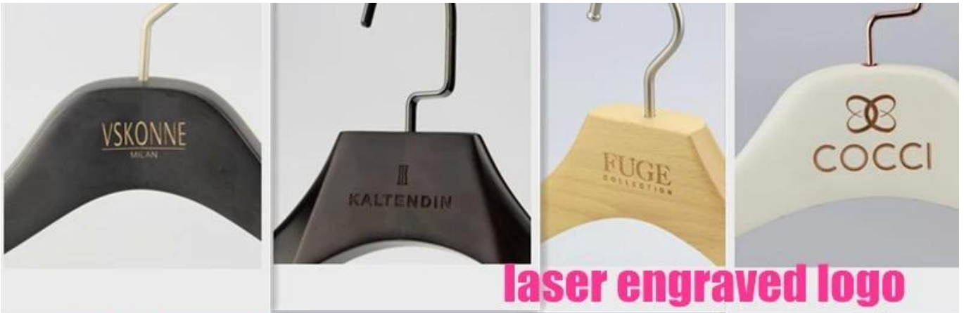
laser engraved logo