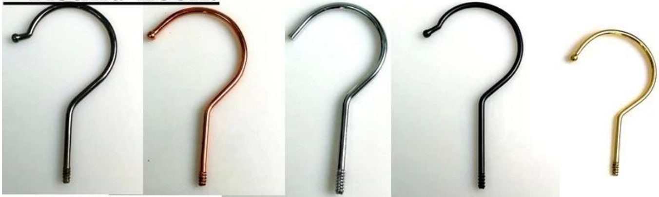
Dia: \varnothing 3.8mm gun black