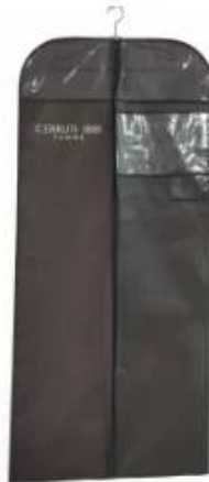
brown suits bags