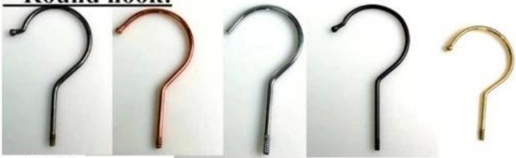
Dia: ⌀ 3.8mm gun black Dia: ⌀ 3.8mm rose gold Dia: ⌀ 4.0mm silver Dia: ⌀ 3.8mm black gold