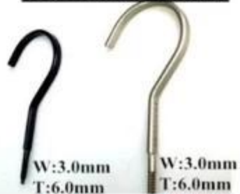
W:3.0mm T:6.0mm black W:3.0mm T:6.0mm matt silver