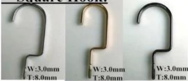
W:3.0mm T:8.0mm silver W:3.0mm T:8.0mm champagne gold W:3.0mm T:8.0mm gun black