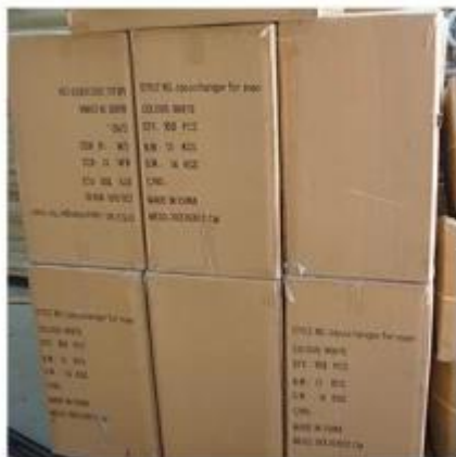
K=K Carton with Shipping Mark

包裝材料之選擇應以保護產品為首要原則 K = K 包裝材料之選擇應以產品之特性為主要考量