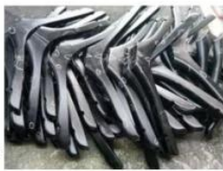
check the product to

spray paint again(hand paint more than 4 times)