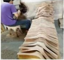
(Hand polishing more than 4 times)