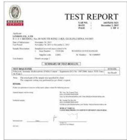
Product Test Report