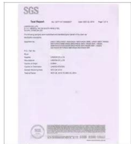
Product Test Report