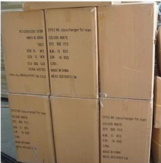
K=K Carton with Shipping Mark