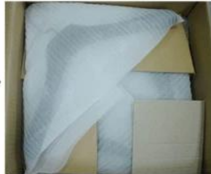
Place Layer by Layer

0000 00 00 00 0 00 0000 0000 00 0, 0 0000 00 0 00000 00 0 0000 00 0 K = K 0000 00. 00 0 00 00 00 00, 00000 0000 00 00 0 00 00 00. 00, 00 0 requirement 00000 00 00 00 00 00 0 00000 0000 00.