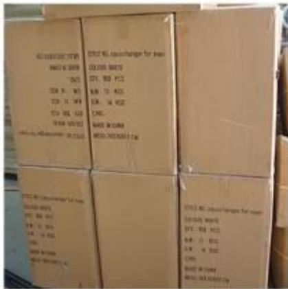
K=K Carton with Shipping Mark