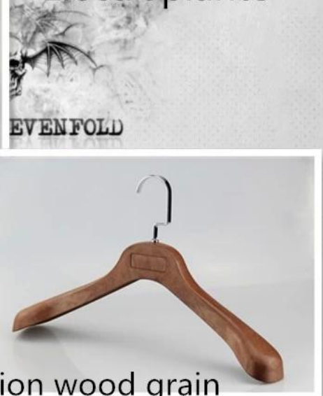
Limitation wood grain

1. 塑膠衣架: 輕便、耐用、易於清潔，但易於變形。 2. 木質衣架: 美觀、耐用，但易於受潮、變形。 3. 金屬衣架: 堅固、耐用，但易於氧化、變色。 4. 絨布衣架: 柔軟、耐用，但易於沾灰、變色。