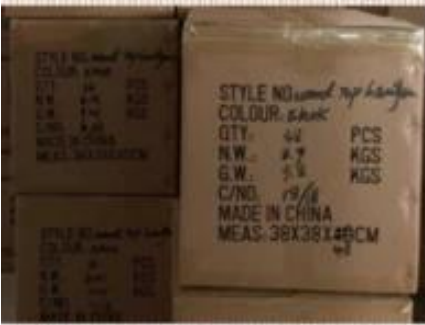
print Mark & details

□□ □□□ □□ □□ □□ □□□□□. □□, □□ □□ □□□□□□ □□. □□□ □□□ □□□ □□□□□ □□, □□□ □□□ □□ □□□ □□ □□ □□□□□□□□. □ □□ □□□ □□ □□□□□□ □□ □□□ □□ □□□□□ □□□□ □□ □ □□ □□□□.