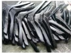
check the product to

spray paint again(hand paint more than 4 times)