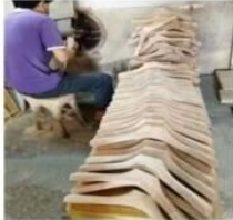
(Hand polishing more than 4 times)