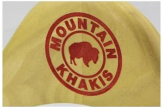
Laser logo in other color