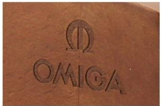
Laser logo before paint