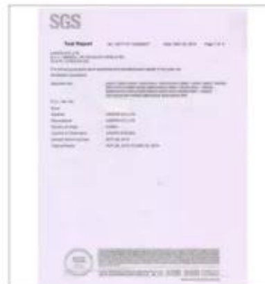
Product Test Report