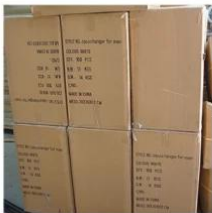
K=K Carton with Shipping Mark