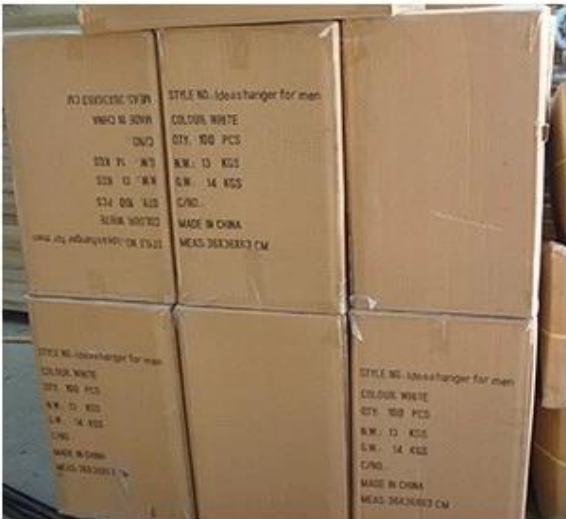
K=K Carton with Shipping Mark