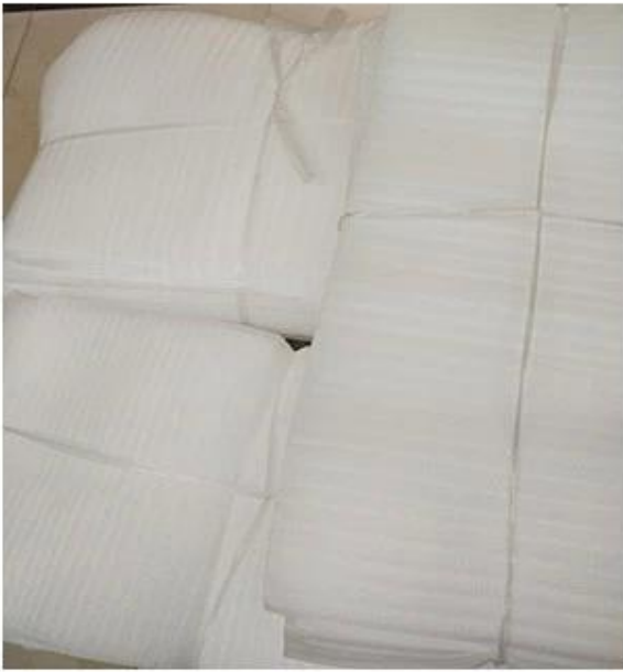
PE Foam Bag