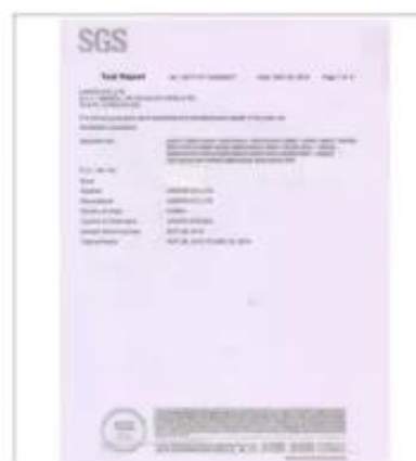
Product Test Report