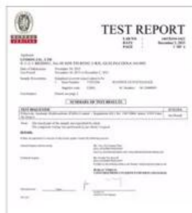
Product Test Report