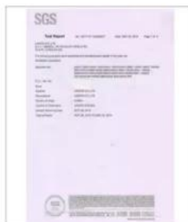
Product Test Report