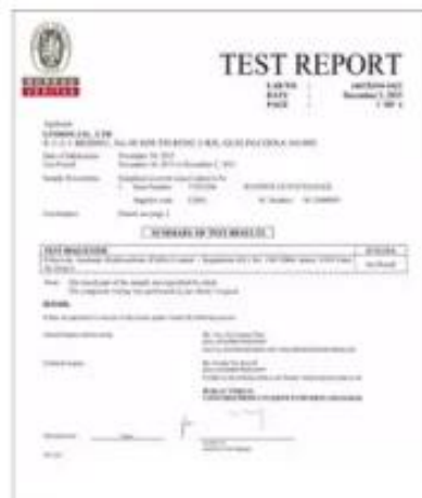
Product Test Report