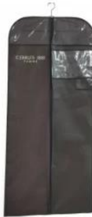
brown suits bags