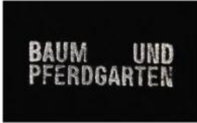
silver hot stamping logo