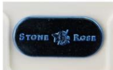
plastic plate logo