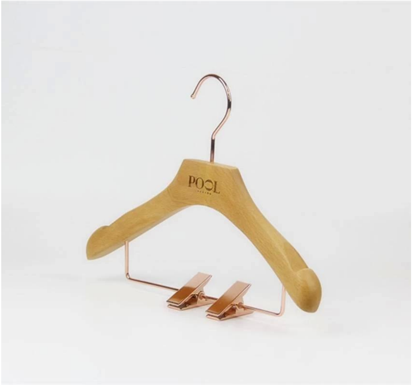
THE KINDS OF METAL ACCESSORIES