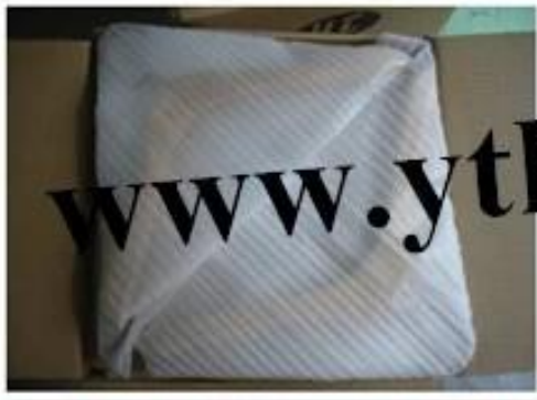
wooden hanger package