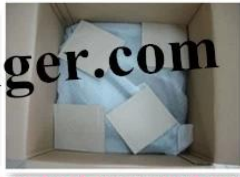
wooden hanger package