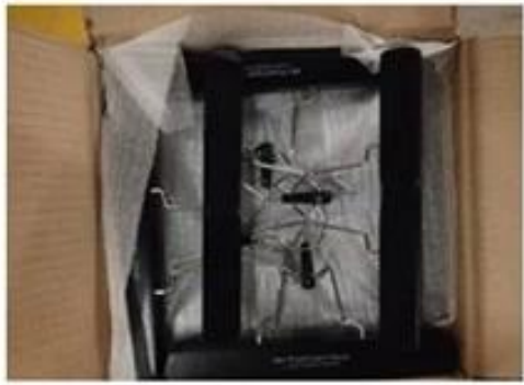
extension hair hanger