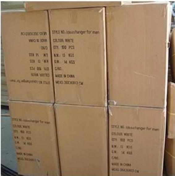
K=K Carton with Shipping Mark