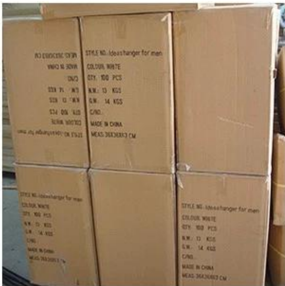
K=K Carton with Shipping Mark