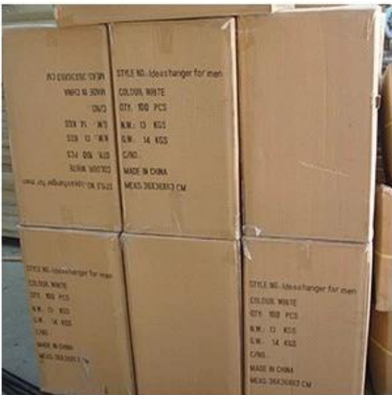
K=K Carton with Shipping Mark