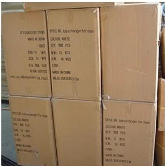
K=K Carton with Shipping Mark