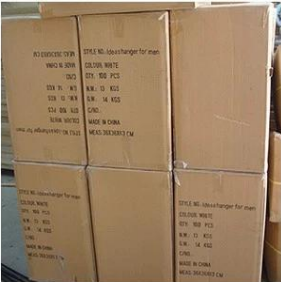
K=K Carton with Shipping Mark