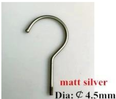
matt silver Dia: \varnothing 4.5mm