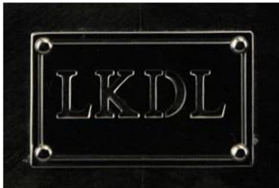
Metal plate logo