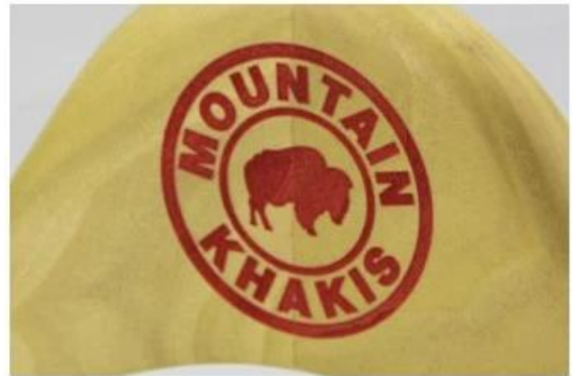
Laser logo in other color