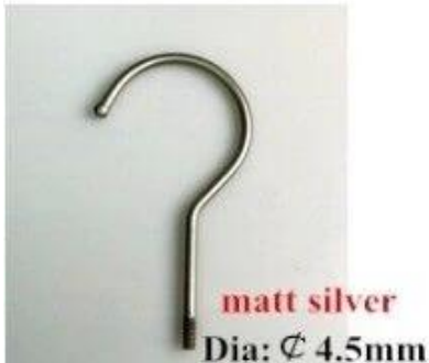
matt silver Dia: \varnothing 4.5mm