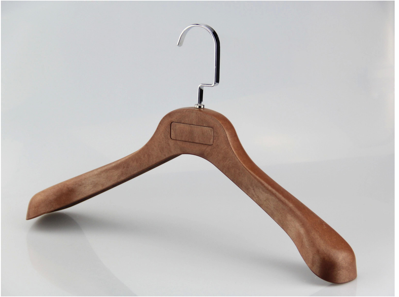
Changeable Metal Accessory