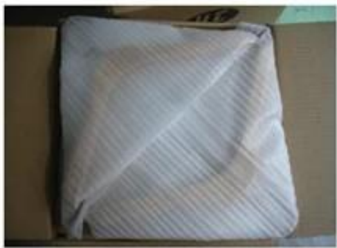
wooden hanger package