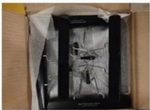
extension hair hanger