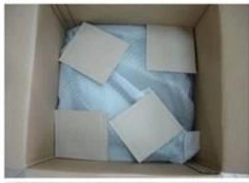
wooden hanger package