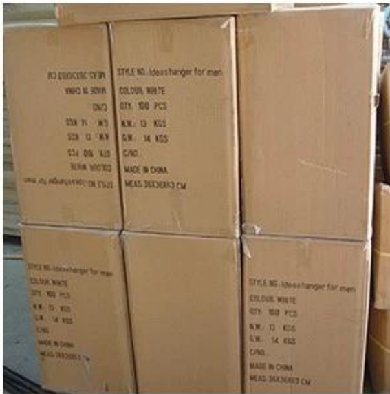
K=K Carton with Shipping Mark