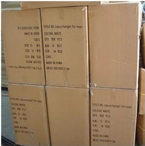
K=K Carton with Shipping Mark