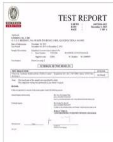
Product Test Report