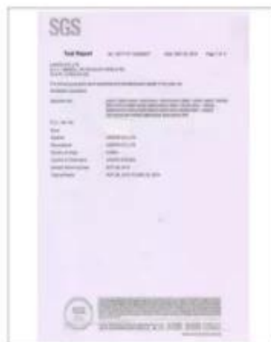
Product Test Report