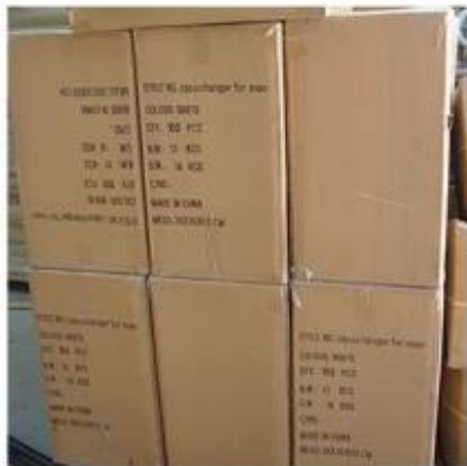
K=K Carton with Shipping Mark