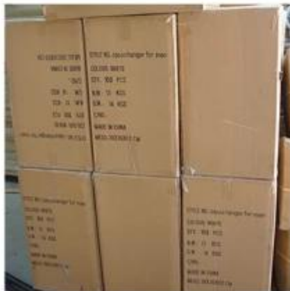
K=K Carton with Shipping Mark