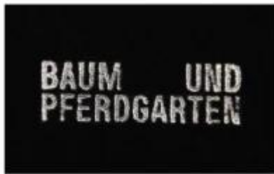
silver hot stamping logo