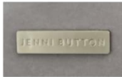
metal plate logo