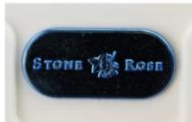
plastic plate logo