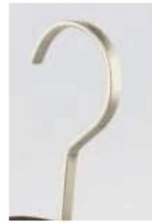
flat pearl nickel