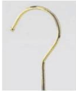
light gold with bulb