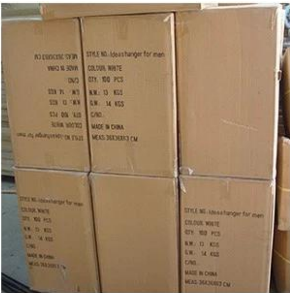
K=K Carton with Shipping Mark