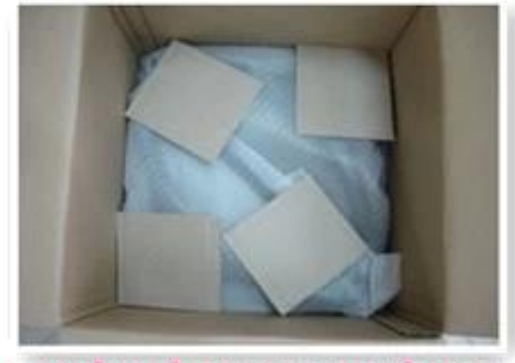
wooden hanger package