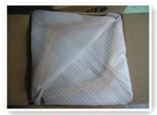
wooden hanger package