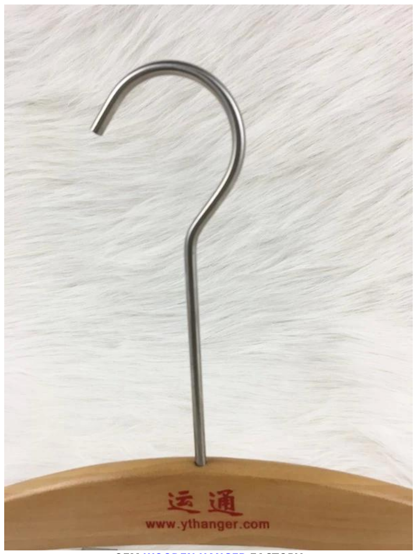
OEM WOODEN HANGER FACTORY