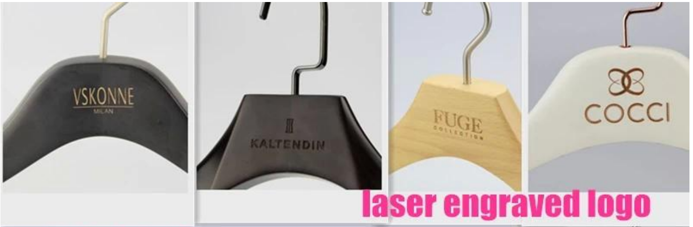
laser engraved logo