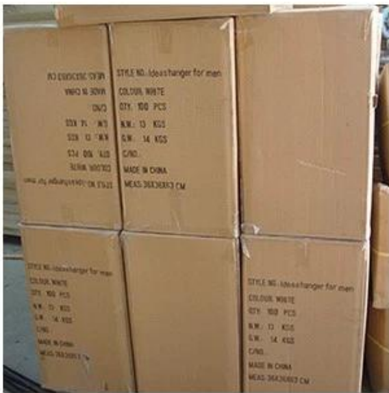
K=K Carton with Shipping Mark