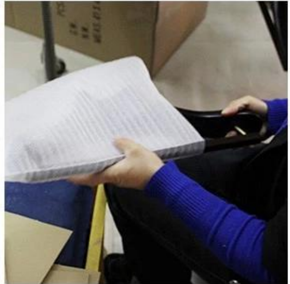
1pc Hanger with 1pc Bag