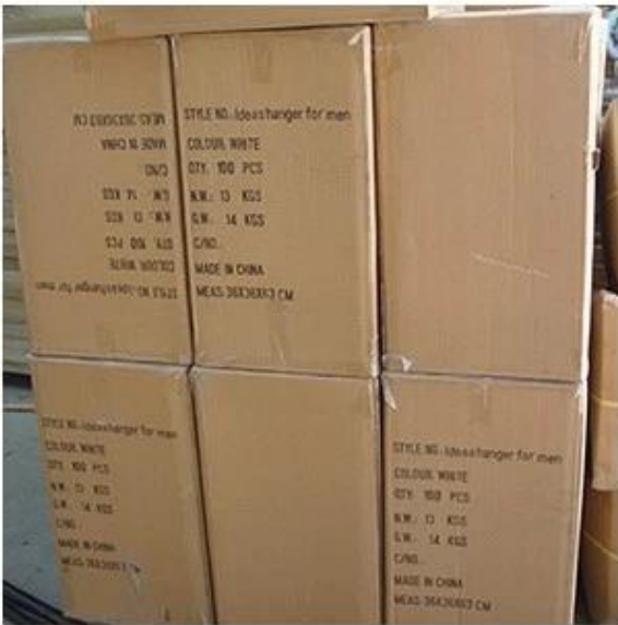
K=K Carton with Shipping Mark