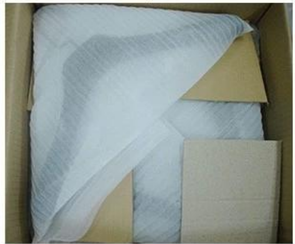
Place Layer by Layer

PE Foam bag package, 2pcs each layer, cardboard partitioned off each layer for bag hanger, protect hangers well in transit.