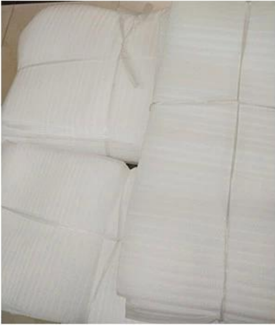
PE Foam Bag