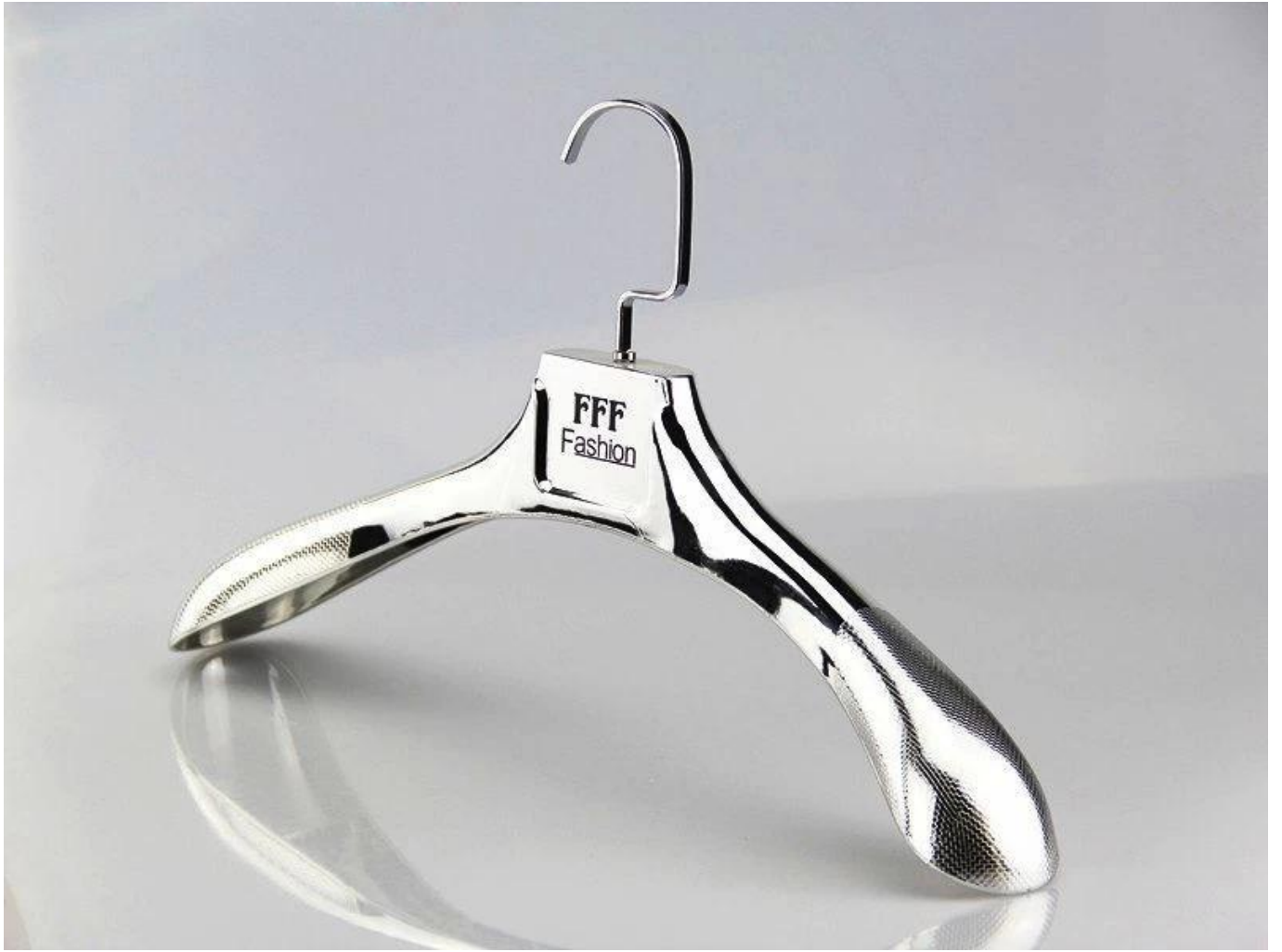
Changeable Metal Accessory