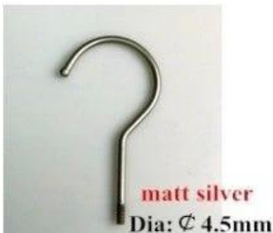
matt silver Dia: \varnothing 4.5mm