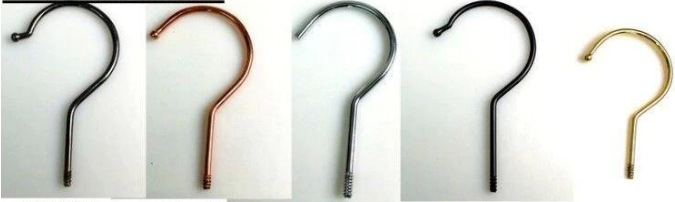
Dia: \varnothing 3.8mm gun black