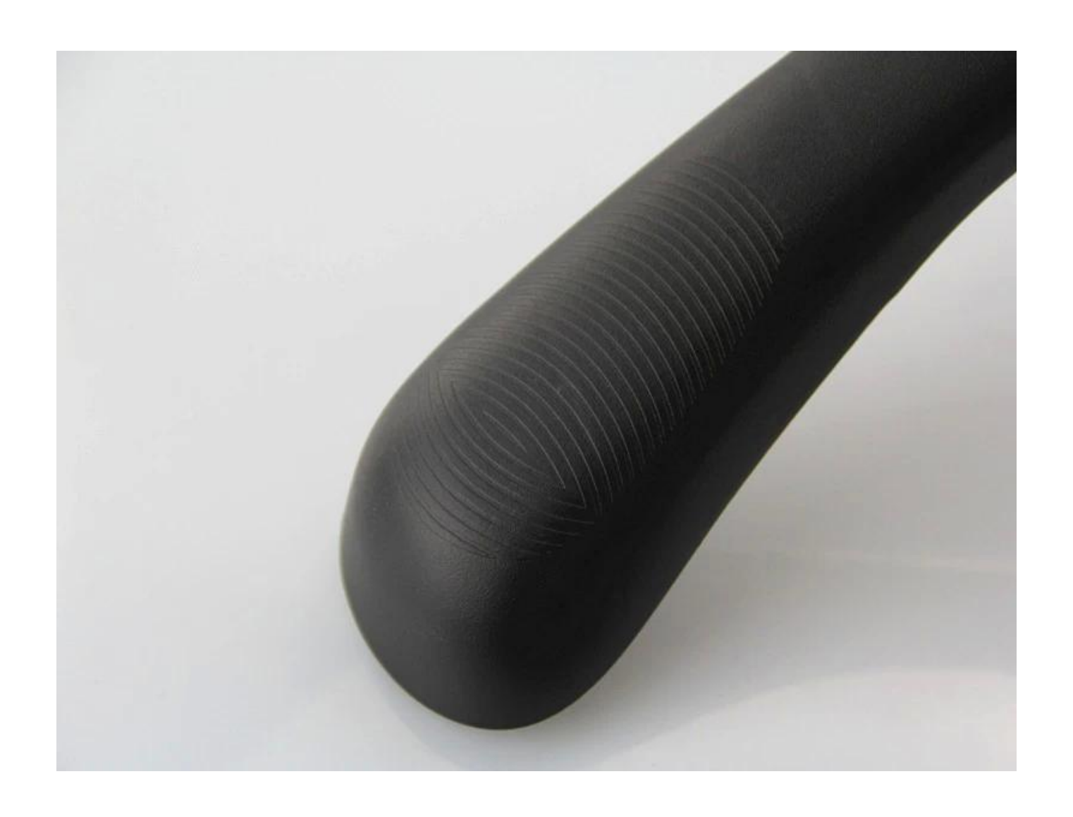
Changeable Metal Accessory