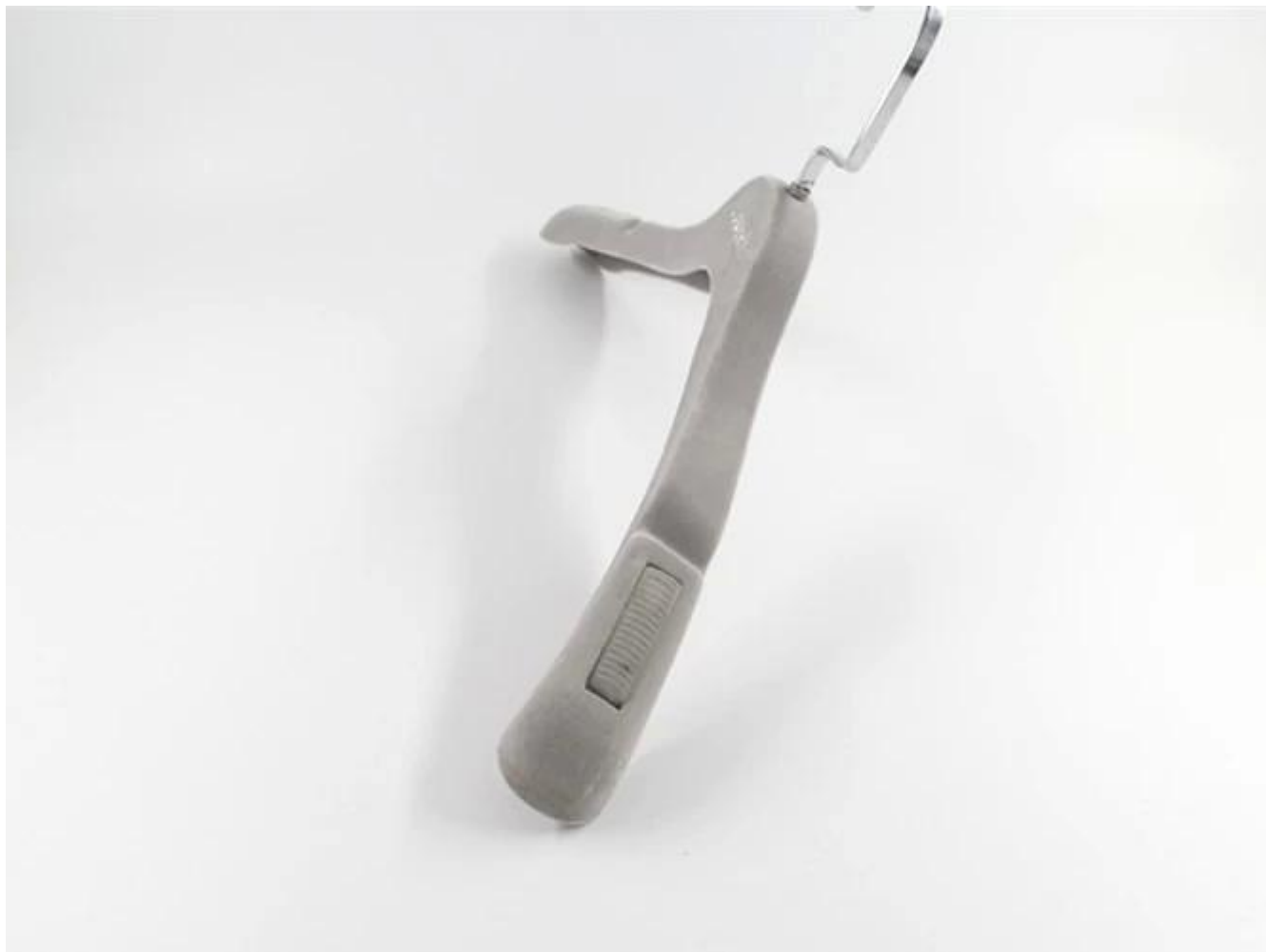
Changeable Metal Accessory