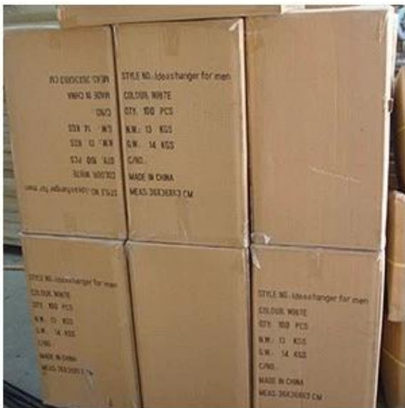
K=K Carton with Shipping Mark

For electroplating hanger and rubber coated plastic hanger , each hanger in a poly bag, then in strong carton;