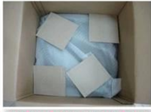
wooden hanger package