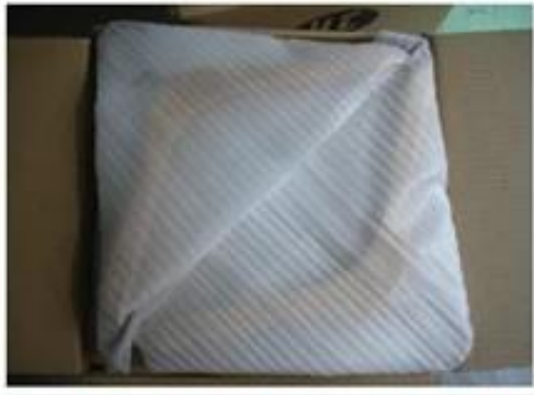
wooden hanger package