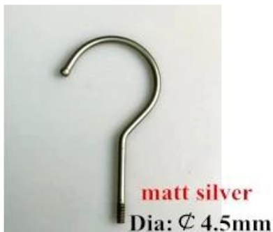
matt silver Dia: \varnothing 4.5mm