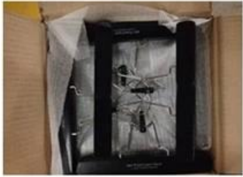
extension hair hanger