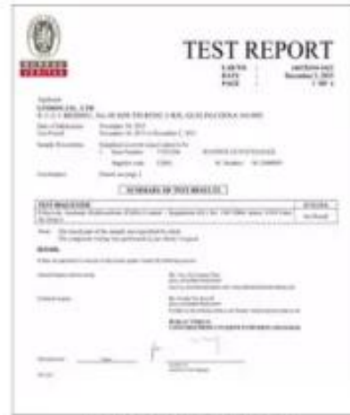
Product Test Report