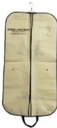
off white suits bag