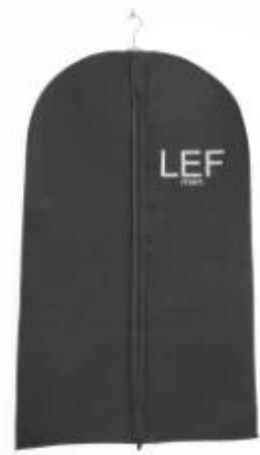
black suits bags