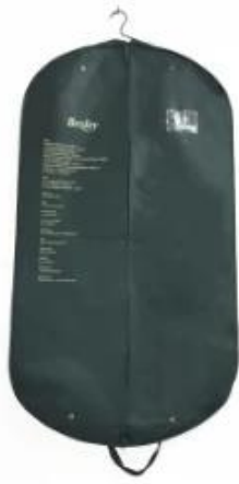
Green suits bags