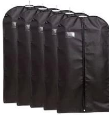
black suits bags