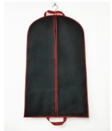
black suits bags