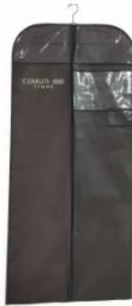
brown suits bags