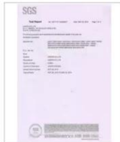
Product Test Report