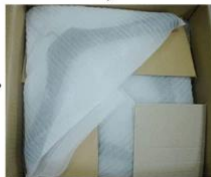
Place Layer by Layer