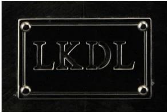
Metal plate logo