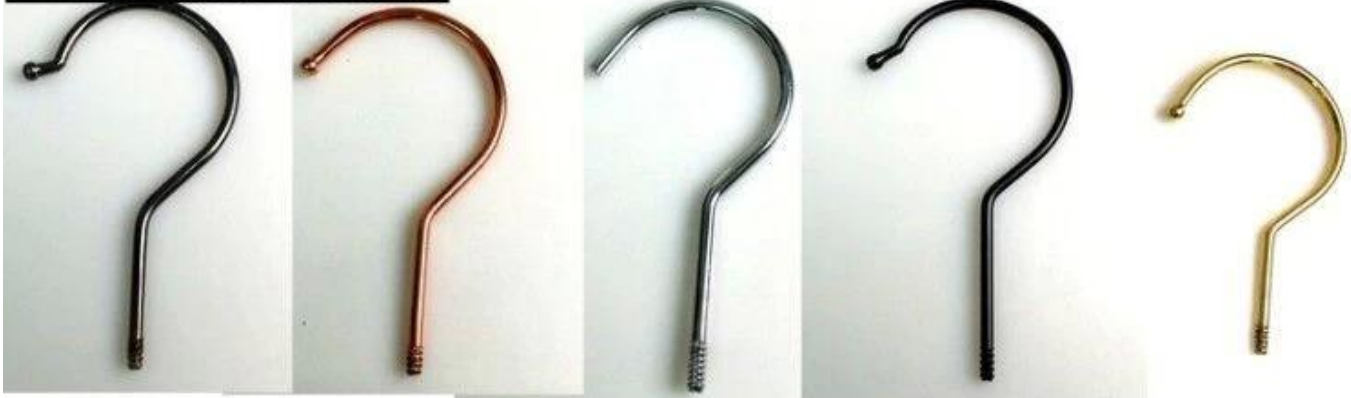
Dia: \varnothing 3.8mm gun black