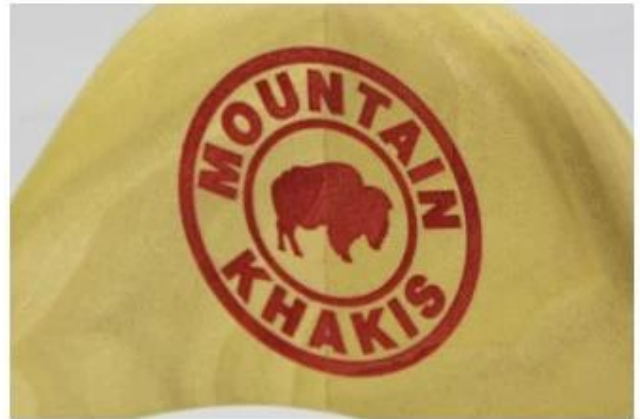
Laser logo in other color