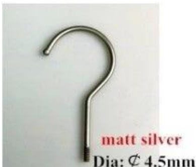
matt silver Dia: \varnothing 4.5mm